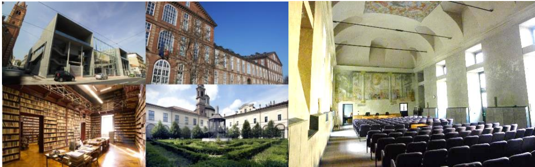
Università di Torino DBIOS (University of Turin)

A preliminary schedule of activities would be: