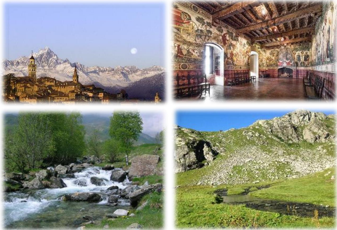
Wednesday field trip

We are also planning to organise a series of cultural and recreational events and evening activities for participants and a plan of activities, visits, and excursions for accompanying people. We would like to open a space also dedicated to non-specialists but enthusiasts of mayflies and stoneflies: for example, fly fishermen (Turin hosts the oldest fly-fishing club in Italy).